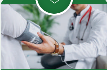
LIFE & HEALTH