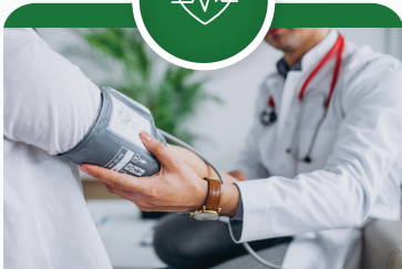
LIFE & HEALTH